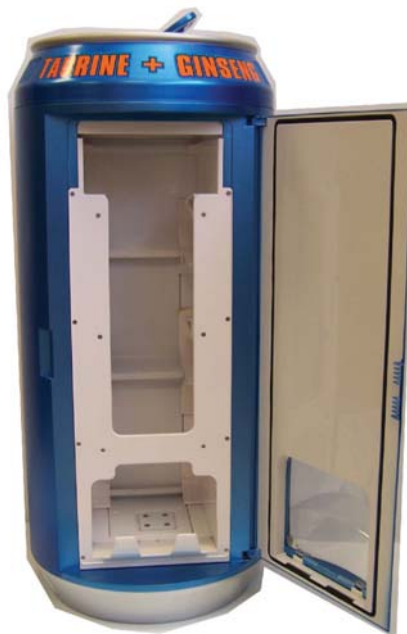
FRONT INTERIOR RACK VIEW